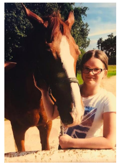
I have been playing the cello for about seven years now and have had great success with it since I have already played in different ensembles. But that is not my only hobby. One of my favourite hobbies is horse-riding which I have been doing every week for five years now. There are different horses on the ranch and I helped to calm them down to make them easier to ride for younger children. I spend as much time as I can with the horses but also with my cats. I grew up with animals so I am not afraid of any of them.

When I am not at the stable I usually sit somewhere in the house, reading a book which is my great passion. I also like thinking about own stories and write them. Drawing is also a hobby of mine which I do as much as possible. Usually reading and writing calm me down after a very exhausting day.