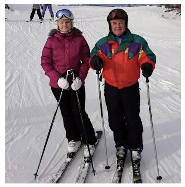
Skiing with grandpa