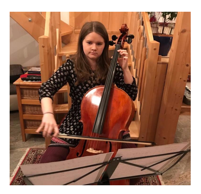
Me and my favourite horse Peldash

When I am not at the stable I usually sit somewhere in the house, reading a book which is my great passion. I also like thinking about own stories and write them. Drawing is also a hobby of mine which I do as much as possible. Usually reading and writing calm me down after a very exhausting day.